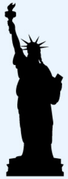
STATUE OF LIBERTY is shown for size reference

Shown with Module 2 and Module 3 attached behind Module 1. Module 1 is the DRAS DERSHII.